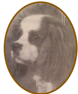
Cotterlee Canna Lass