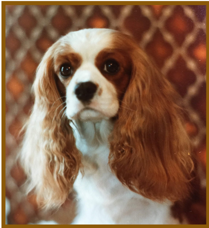
Ch Devon Lass of Homerbrent at Ricksbury