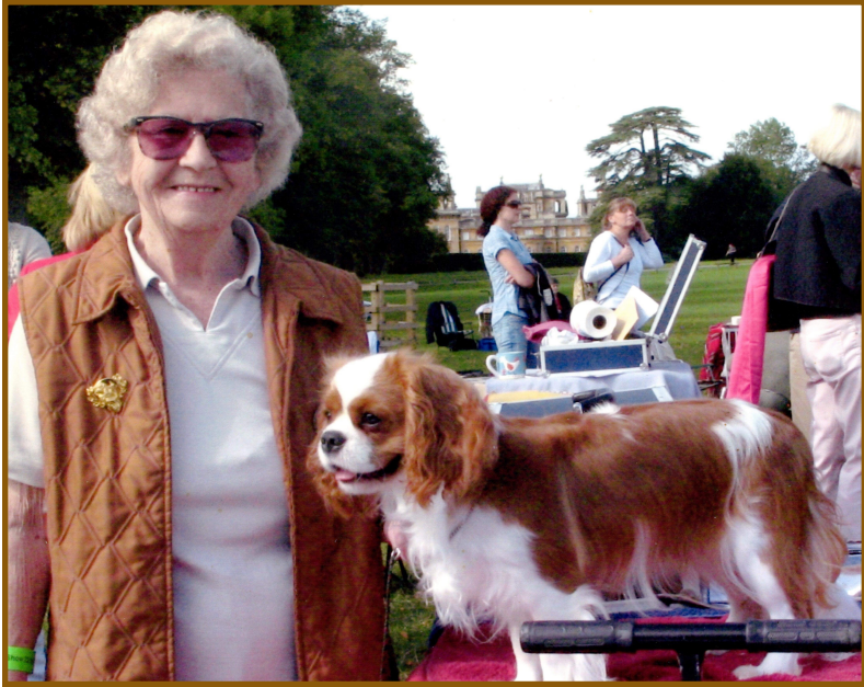
Cinderlace Primrose at Merryoth

‘Words will never be vibrant and strong enough to begin to shine a light on her essence.’